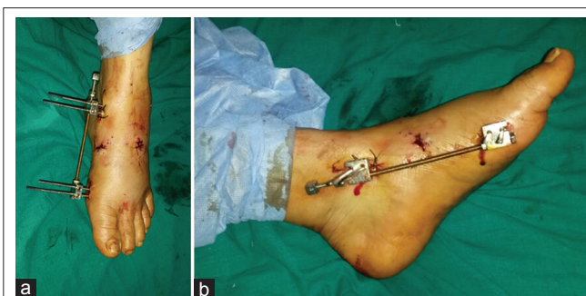
Figure 3: (a and b) Intraoperative pictures of distractor application.