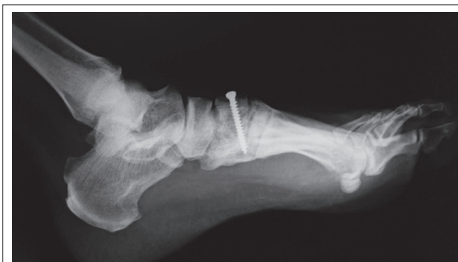
Figure 4: Follow-up radiograph at 1 year.

twist injury is the cause of dorsal dislocation of intermediate cuneiform with displaced fracture of the first cuneiform in this case.