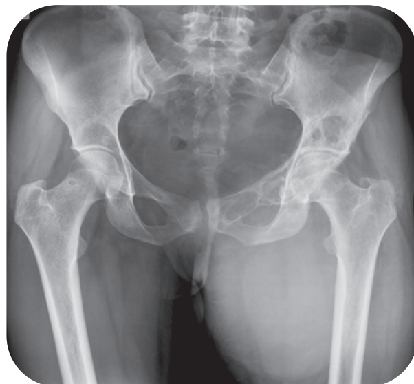
Figure 1 : Conventional AP radiograph of pelvis shows lytic expansile lesions of left hemi-pelvis with associated cortical thinning involving superior pubic ramus, iliac wing and acetabular roof. Large soft tissue swelling showing interspersed foci of calcification is seen in left proximal thigh. Underlying left femur appears normal.

35 year lady presented to surgery department of our hospital with history of swelling over left thigh over long duration which has rapidly increased over a period of last three months. She was afebrile and her vital parameters were normal. On local examination soft tissue mass of size approximately 13x12cms was palpated. It was fixed, tender and showed superficial erythema. Various laboratory investigations including