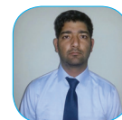
Dr. Mufti Mehmood