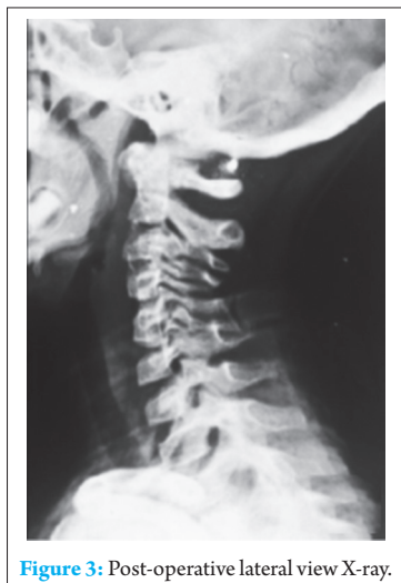
Figure 3: Post-operative lateral view X-ray.

is usually asymptomatic and detected incidentally. The schisis defect observed is probably due to the non-union of the secondary ossification centers of the spine (which usually completes in the second decade). There is also a case report showing hyperplasia of the C7 spinous process in a 24-year-old woman published in the year 2007 [5].