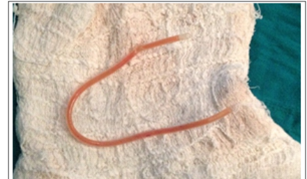
Figure 3: Removed drain fragment.

(Fig.2 and 3). At his latest follow-up (16-month post-ACL surgery and 11 months after removal of the drain), the patient had regained full function and was playing at the pre-injury level of 10 as per Tegner scale of sports activity [3].