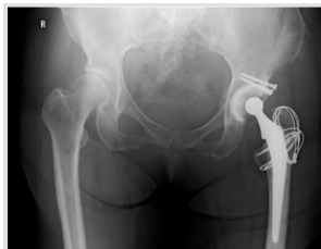
Figure 2: X-ray photograph on the day of admission. Loosening of the implants was not seen in this X-ray photograph