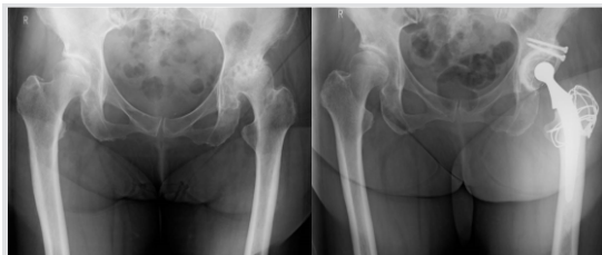
Figure 1: (a and b) Pre-operative and post-operative X-ray photograph. Cemented total hip arthroplasty was performed with transtrochanteric approach