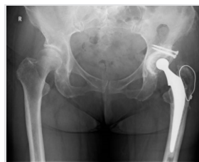
Figure 4: X-ray photograph 24 months after discharge. Roentgenographic loosening of the prosthesis was not seen

greater trochanter and debride granulation and synovia on the 26th day. From multiple pieces of the trochanteric wires, granulation, and synovia, YE was detected, and it was susceptible to CTRX. We suggested revision arthroplasty to her, but she never agreed because the symptom subsided, so we continued treatment