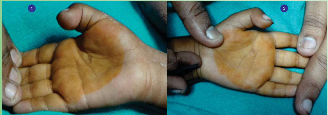
Figure 1,2: Pre-operative flexion deformity of both thumbs

deformity of both the thumbs. The deformity was noticed when the child was six months old, but the finger could be extended to the neutral position at that time. Since one year, extension has not been possible and the finger becomes painful if it is tried. The child did not have any other anomaly. There was no history of trigger thumb in maternal or paternal families.