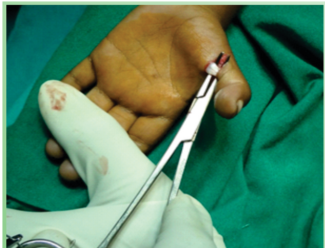
Figure 3: Stenosis of the flexor sheath.

The aetiology of trigger thumb is not well understood. The stenosed sheath and Notta's nodule are biopsied earlier, but no definite pathology can be established [6]. We haven't taken biopsy from either site.