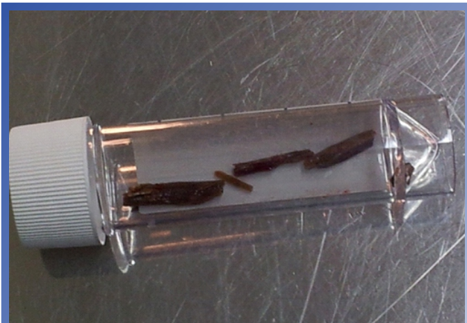
Fig 5 : The removed specimen of wooden splinters