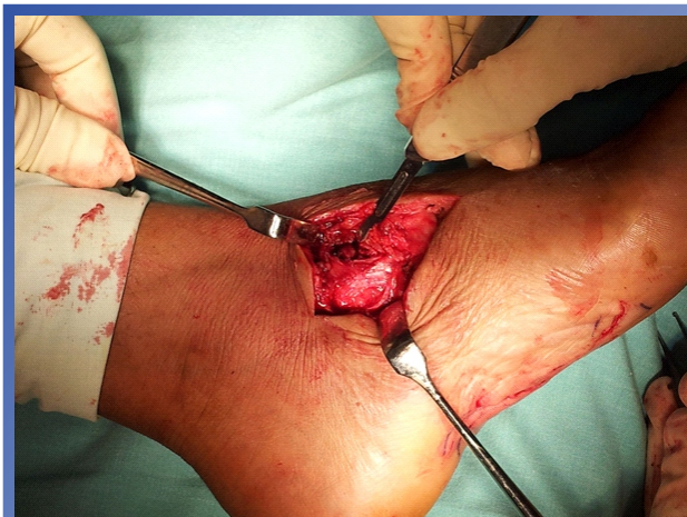
Fig 4 : Second incision over medial aspect of midfoot including sinus

Foreign body penetration injuries are very much common