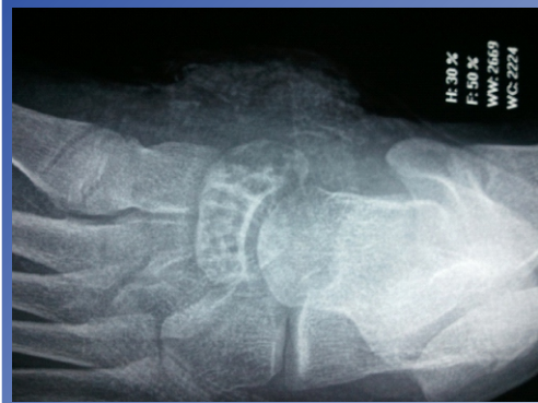
Figure 1: Pre-op X-ray: showing osteolytic lesion involving navicular bone with intact cortex