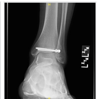
Figure 8: Left ankle anterior-posterior view at 1-year follow-up showing stable screws transfixing distal tibial epiphysis with congruent joint spaces and unremarkable soft tissue.