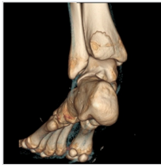
Figure 3: Left ankle three-dimensional computed tomography, posterior oblique view showing Volkmann fracture.