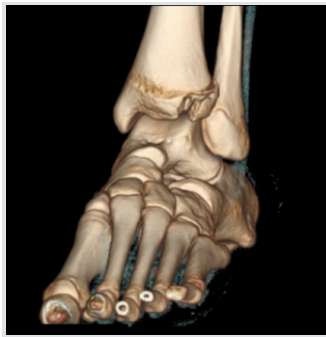
Figure 2: Left ankle three-dimensional computed tomography, anterior-posterior view showing the Tillaux-Chaput fracture.