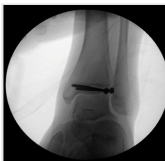
Figure 6: Anterior-posterior view of intraoperative fluoroscopic image showing interval placement of two screws.