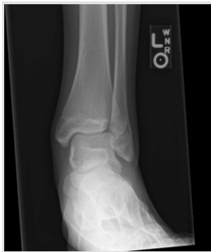
Figure 1: Initial left ankle X-ray, anterior-posterior view.