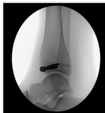
Figure 7: Lateral view of intraoperative fluoroscopic image showing interval placement of two screws.