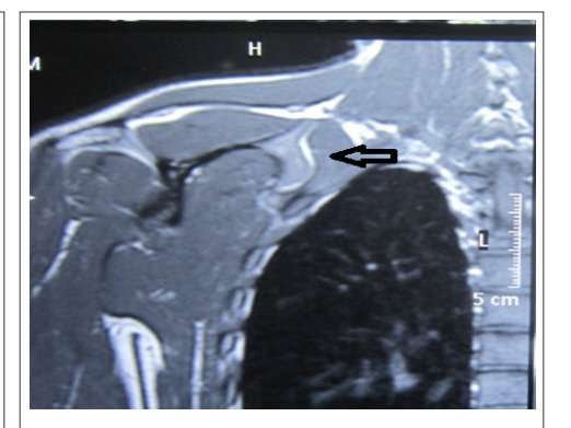
Figure 3: shows the anteroposterior view of right shoulder with an exostosis arising from the superior angle of scapula

Figure 2: shows the anteroposterior view of right shoulder with an exostosis arising from the superior angle of scapula