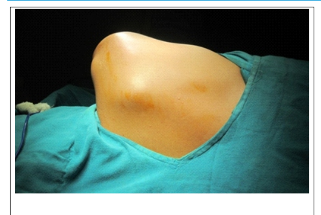
Figure 1: showing swelling over medial border of Rt. Scapula