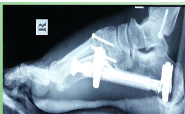
Figure 8: Immediate Post-operative Lateral X-ray of the Foot.