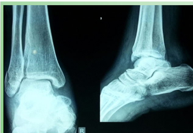
Figure 2: Pre-operative X-ray (AP & Lateral) View of the Ankle Joint.