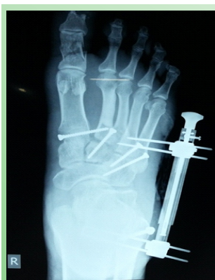
Figure 7: Immediate Post-operative AP View X-ray of the Foot.