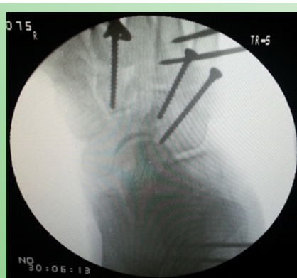
Figure 4: Intra-operative C Arm Image Showing 4mm Cannulated Cancellous Screws from 5th Metatarsal into Cuboid Bone and Another from 2nd Metatarsal into Intermediate Cuneiform.