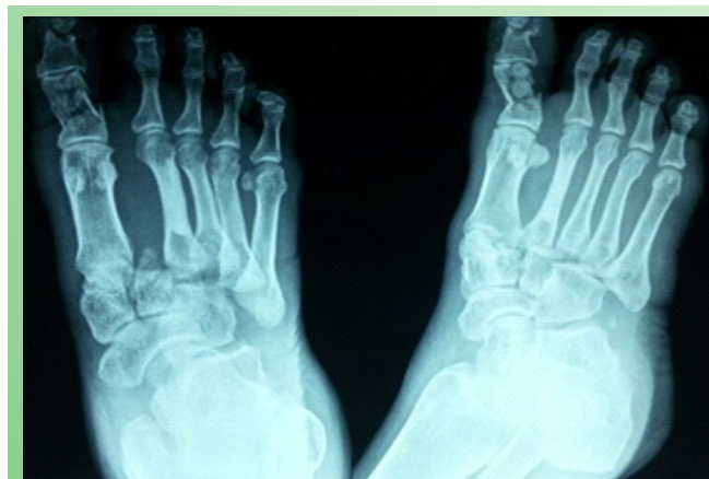
Figure 1: Pre-operative X-ray (Antero-Posterior & Oblique) View of the Right foot.

The term Lisfranc has been described as originating with French surgeon Jacques Lisfranc de St. Martin. He reported on midfoot injuries when cavalymen would fall from their horses with a foot remaining plantar flexed in the stirrup during Napoleon Bonaparte's military campaigns.[5] The Lisfrancs complex is made up of both bony and ligamentous structures that provide support to the transverse arch of