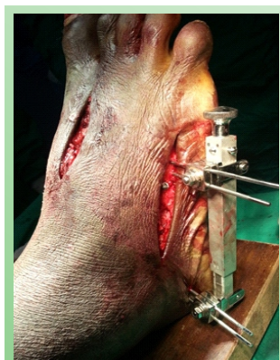
Figure 6: Foot with the Wagner External Fixator Device.

Ebraheim et al have stated that dorsolateral displacement of the second metatarsal base of 1 or 2 mm results in reduction of the tarsometatarsal articular contact area by 13.1% and 25.3%, respectively. They have also stated that regardless of the modality, anatomic alignment needs to be maintained to decrease the risk of posttraumatic arthritis, chronic instability, and pain.[15] Yamamoto et al presented a