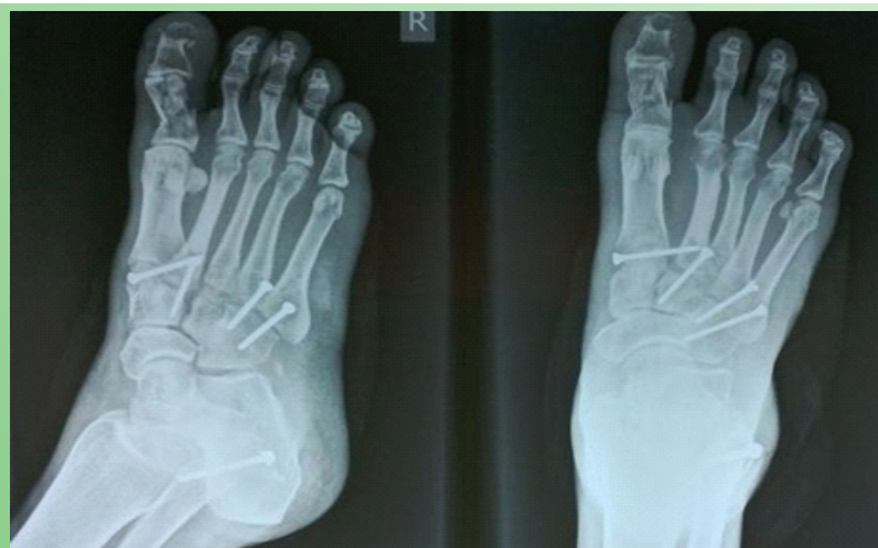
Figure 9: 6 Weeks Post-op X-ray of the Foot (AP & Oblique) after Removal of the External Fixator.

neglected case of lisfrancs fracture dislocation 14 months after being operated for the same with the injury being still unreduced. They performed an arthrodesis of the lisfranc's joint for the painful and deformed foot.[16]