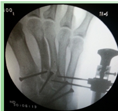
Figure 5: Intra-operative C Arm Image Showing the Above and an Additional Screw from Base of First Metatarsal into the Base of 2nd Metatarsal.

midfoot. Second metatarsal gets locked in between the cuneiform bones which provide the bony stability and the ligamentous stability is provided by the plantar and the intercuneiform ligaments, there is no tissue coverage dorsally.[6]