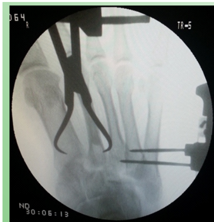
Figure 3: Intra-op C Arm Image Showing 2 Schanz Pins Passed in the 4th and 5th Metatarsal.