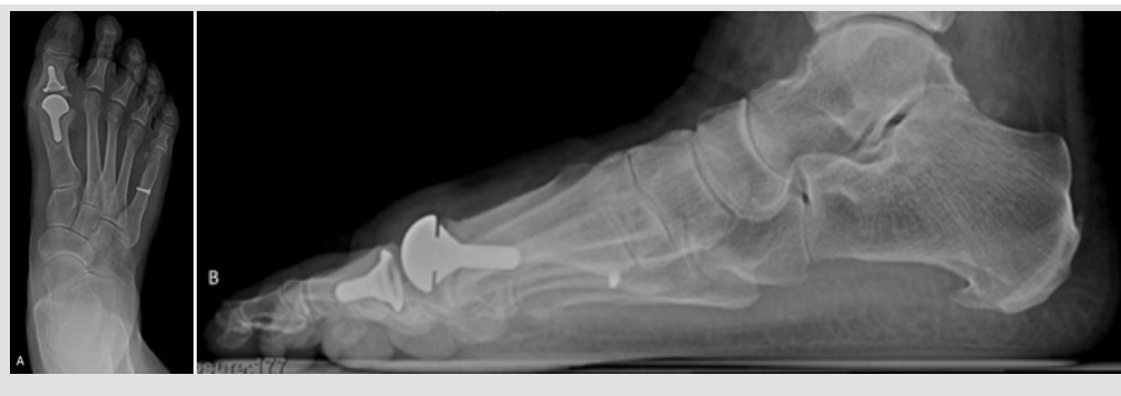
Figure 1: Anteroposterior and lateral preoperative images showing loose metatarsal phalangeal joint arthroplasty.