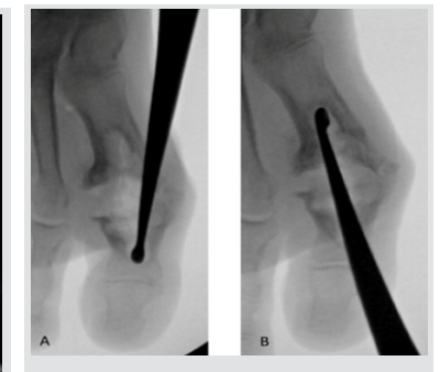
Figure 2: Fluoroscopic images showing bone loss within the proximal phalanx and first metatarsal.

having a first MTPJ arthroplasty in 2004 and long-standing pain in her first MTPJ that worsened with walking. She had attempted a Morton's extension orthotic without pain relief.