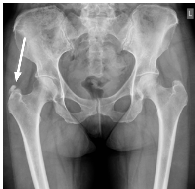
Figure 4: Plain radiograph of pelvis shows the calcification around the tip of the greater trochanter of the right hip

metastatic disease or the case difficult to diagnose, then a CT or MRI scan is recommended. Calcific tendinitis usually is a self-limiting condition; however, symptomatic treatment includes analgesia, NSAIDs, local steroid, rest and physiotherapy. Invasive treatment involves local steroid injections and arthroscopic