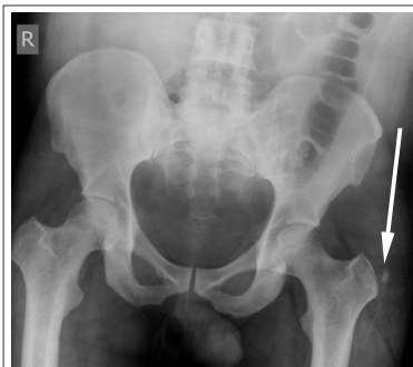
Figure 1: Antero-posterior radiograph of the pelvis showing calcific lesion adjacent to the greater trochanter of the left hip.