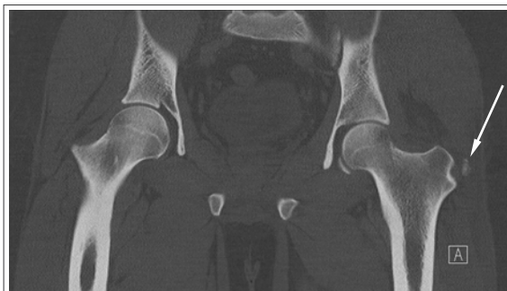
Figure 2: Computed tomography coronal image showing calcific lesion around the greater trochanter of the left hip.

In many cases the calcification may be asymptomatic, although calcific tendinitis can be an important cause of severe pain. Calcific tendinitis of the gluteus medius usually presents with pain or tenderness around the greater trochanter. Hip movements may be limited. Fever, local oedema and raised inflammatory markers may be present. Calcific tendinitis can be either acute or chronic, depending on the duration and mode of presentation. Acute calcific tendinitis usually lasts less than two weeks. The chronic type usually dissipates without any need for surgical intervention, although Kandemir et al suggested endoscopic treatment for chronic gluteus medius calcific tendinitis. The abrupt onset of the calcific tendinitis can mimic hip infections, metastatic diseases or fractures, which are usually diagnosed based on clinical suspicion, followed by plain radiograph of the hip. If there is concern about infection or