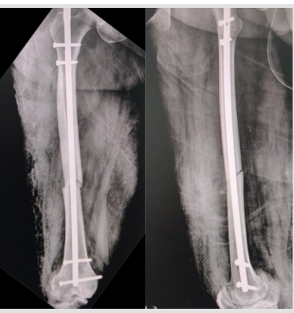
Figure 2: Post-operative radiograph showing acceptable reduction and stable fixation with an intramedullary nail.

augmented plating, and bone grafting as described by Sancheti et al. [9] in cases of aseptic femoral diaphyseal non-union and achieved successful union with excellent functional outcomes without any complications. Informed consent was obtained from the patient regarding the inclusion in the study and the need for a case report.