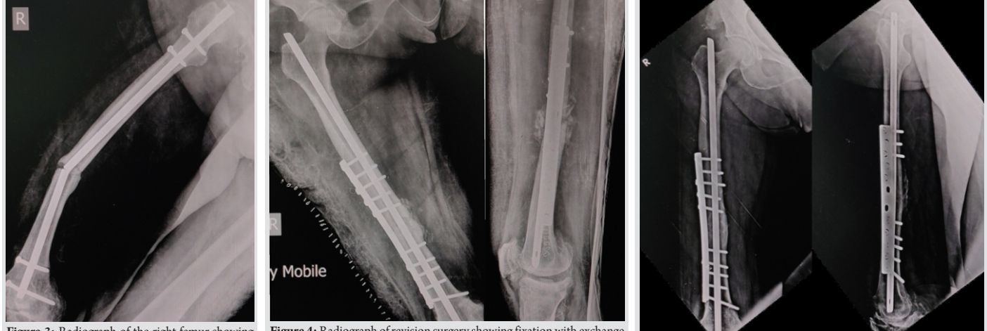
Figure 3: Radiograph of the right femur showing 1 refracture with segmental breakage of the nail with 1 minimal callus formation.

with thigh pain after getting up from sitting position. Clinical examination showed varus deformity of the right thigh with radiographs showing refracture with segmental breakage of the nail at the level of fracture and distal bolts with minimal callus formation (Fig. 3). This led to the impression that the AFF in the diaphyseal region did not unite in 9 months. Subsequently, the patient was treated with exposure of the fracture site, removal of the nail, and fibrous union. The sclerotic bone ends were removed until there was punctuate bleeding from the bone ends. The fixation was performed with K-nail and augmented plating, as shown by Sancheti et al. [9] and was supplemented with osteoperiosteal flaps and iliac crest bone grafting (ICBG) (Fig. 4). Postoperatively, the patient was started on active exercises and non-weight-bearing walking with walker support on day 2and was discharged from the hospital on day 5. The patient was followed up regularly at 1-month intervals. The radiographs at 3 months showed good callus formation and the patient was advised to complete weight-bearing. The fracture healed successfully at 6 months and the patient started walking without support. At 1-year follow-up, the patient had full hip and knee range of motion and radiographs showed complete