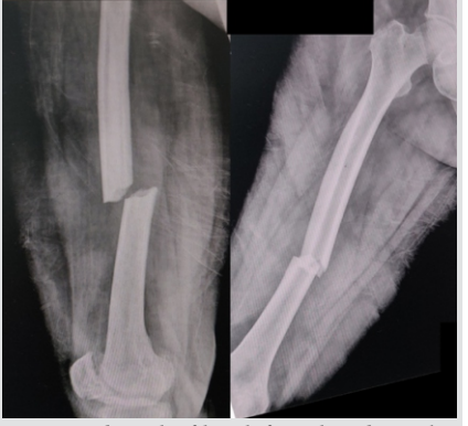
Figure 1: Radiographs of the right femur showed a complete fracture of the right femur shaft at the isthmus with the transverse lateral cortex, medial spike, and increased cortical thickening suggestive of atypical nature of this fracture.