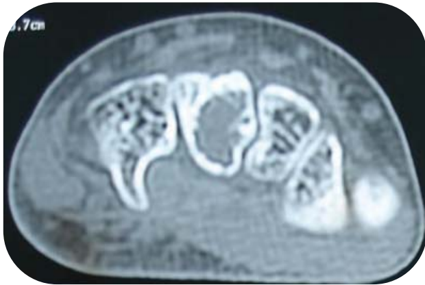
Figure 2: CT Scan wrist showing lytic lesion in Capitate

other carpal bone or joint involvement (Fig 2). Differential diagnosis at the end of imaging study included aneurismal bone cyst (ABC), giant cell tumour (GCT) and enchondroma.