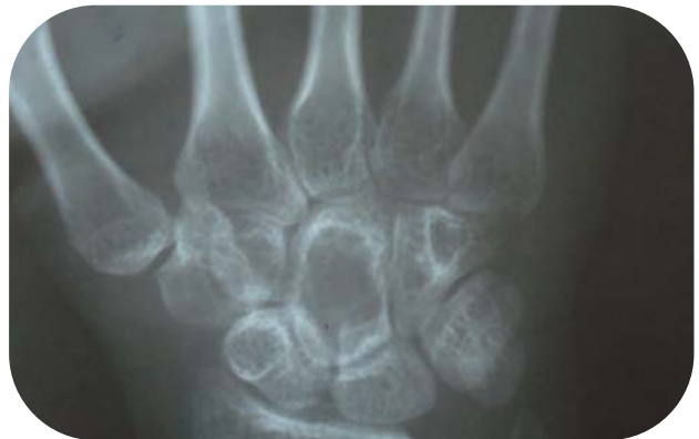
Figure 1: Plain radiograph of wrist showing lytic lesion in Capitate

Radiograph of the left wrist posteroanterior and lateral view showed a lytic lesion in the capitate bone with thinned out cortex (Fig. 1). Computed Tomography (CT scan) of the wrist revealed a non expansile lytic lesion in the left Capitate. There was no evidence of