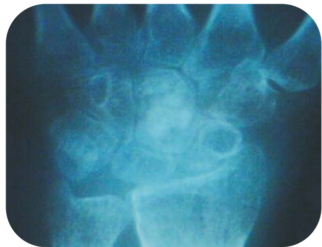
Figure 5: 1 year follow up radiograph showing no recurrence

Patient was followed up clinically and radiologically at regular intervals of 6 weeks, 3 months, 6 months and 1 year. At the end of 1 year follow up, patient was symptom free and near normal range of movements and with no evidence of recurrence (Fig. 5).