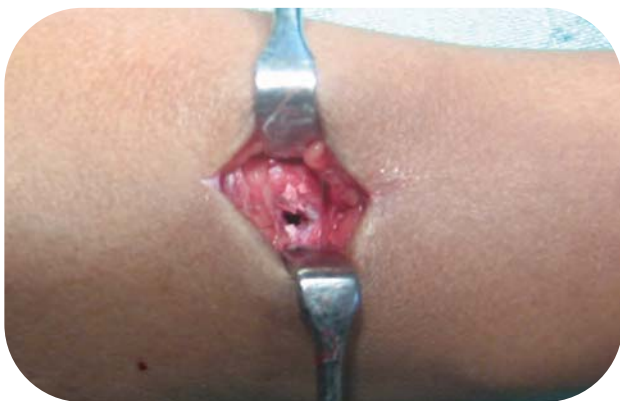
Figure 3: Intra operative picture showing cavity in Capitate after extended curettage of the lesion

other carpal bone or joint involvement (Fig 2). Differential diagnosis at the end of imaging study included aneurismal bone cyst (ABC), giant cell tumour (GCT) and enchondroma.