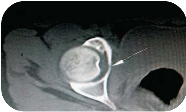
Figure 2: Axial CT showing undisplaced quadrilateral plate fracture on the right side. (Arrow points to the fracture)

sections (Fig. 3). There was no involvement of the acetabular walls or columns. The weight bearing portion of the acetabulum, the acetabular roof was intact (Fig. 3). We decided to treat the quadrilateral