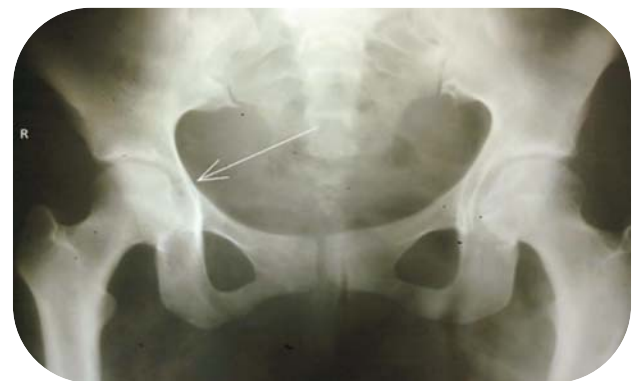
Figure 1: Antero posterior Radiograph of the pelvis showing acetabular fracture on the right side. (Arrow points to the fracture)

A 22 year old lady slipped from stairs and landed on the greater trochanter of her right side. On presentation to the emergency department, she had pain over her right hip and was unable to stand or walk. Her vitals were stable. Movements of her right hip were painless. Tenderness could be elicited on bi trochanteric compression. There was no distal neurovascular deficit. Radiograph was ordered. On the right side, an atypical fracture pattern could be seen on plain radiograph (Fig. 1). CT scan showed an undisplaced transverse isolated quadrilateral plate fracture of acetabulum on axial (Fig. 2) and coronal