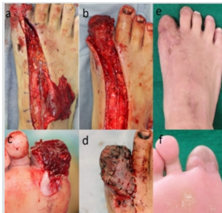
Figure 2: (a–d) Intraoperative images of the reverse extensor digitorum brevis flap. (e and f) The surgical site at the right hallux, 12 months after surgery.