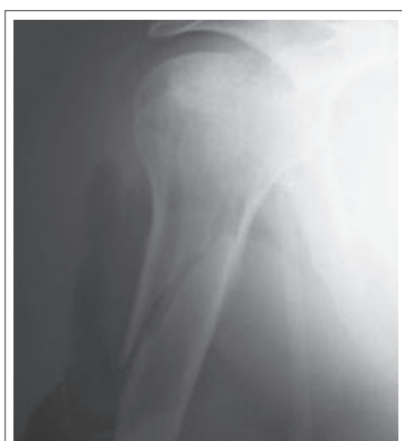
Figure 1: X-ray of the right shoulder: Single incidence.

The discharge from the hospital was carried out 28 days after shoulder surgery. Three weeks later, the radiography showed ossifications with Grade 3 glenoid starting point according to Kjaersgaard-Andersen et al.