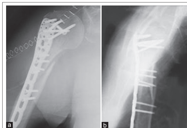
Figure 3: (a) Face postoperative X-ray control. (b) Profile postoperative X-ray control.

Their occurrence mechanism is still unclear [2, 3, 9]. Hereditary and acquired factors, trauma and certain treatments such as heparin therapy might predispose to their formation [1, 3, 4, 7, 9, 10, 11, 12]. The operative difficulties and the intervention beyond 10 days due to the transformation of the hematoma around the fracture may increase the risk [1, 12]. We still ignore the possible role of immobilization and rehabilitation in the process of periarticular ossification after surgery [1]. Some of these