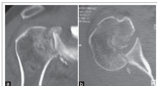
Figure 2: (a and b) Scanner of the shoulder: Fracture-dislocation, fracture of the glenoid, and anterior notch of the humeral head.

(Fig. 4a) [6]. Successive checks confirmed ossifications (Fig. 4b and c). Six months later, the shoulder was stiff and painless with active anterior elevation to 70°, active abduction to 45°, external rotation nil and thumb to the right buttock in internal rotation. The hand-mouth was possible, and the hand-head was the limit. Glenoid humeral ossifications were identical (Fig. 4d).