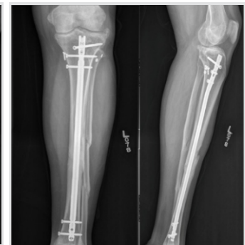
Figure 4: 2-year post-operative X-rays demonstrating complete healing of the left tibial and fibular mid-diaphysis with well-seated IM nail and two buttons without complication.