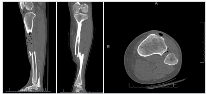
Figure 2: Sagittal (a), coronal (b), and axial (c) computed tomography images of the left lower extremity showing left tibia/fibula fractures with shortening and subcutaneous air tracking to the knee joint.

The patient was taken to the operating room with a plan for irrigation and debridement, intramedullary nailing of the tibia and PTFJ reduction and fixation. The patient was placed in a supine position, and the extremity was prepped and draped in a sterile fashion. The open wound was noted medially, and an ellipse-type incision was made to remove the surrounding