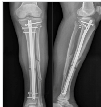
Figure 3: Post-operative anteroposterior (a) and lateral (b) of the left lower extremity demonstrating adequate reduction and stabilization of the left tibia fracture and proximal tibiofibular joint utilizing an intramedullary nail and two suture buttons.