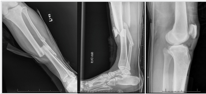
Figure 1: Initial X-rays. Anteroposterior (a), Lateral (b) of the tibia and lateral of the knee (c) demonstrating comminuted mid-shaft tibia and segmental fibula fractures with significant shortening and angulation. Subcutaneous air is seen at the level of the knee joint.

of our knowledge, there are currently no existing reports in the literature that describes PTFJ dislocation repaired with suture buttons or the injury as a pathway for contamination of the knee joint.