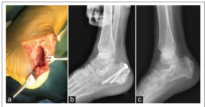
Figure 4: (a) Intraoperative photograph showing pale cancellous bone and a displaced fragment of the calcaneus, (b) radiograph showing open reduction and internal fixation using two cannulated cancellous screws and a cerclage wire, (c) radiograph showing successful bone union with all metals removed.

Johnson stated the relationship between fractures and Charcot joint disease and called the fracture neuropathic fracture [9]. The fracture was considered an early pathological change to Charcot joint disease. Chantelau studied the relationship between diabetes mellitus and Charcot joint disease and called the fracture Charcot fracture [10]. The occurrence of Charcot fracture is reported as being between 0.1% and 2.5% of all diabetic patients [11, 12].