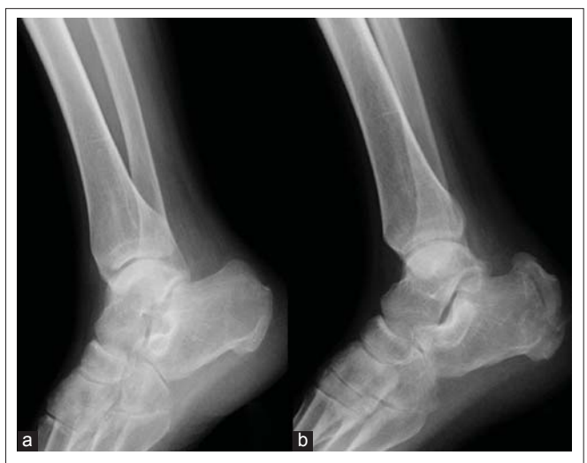
Figure 3: (a) Radiograph of the right heel 4 weeks after total knee arthroplasty, showing no signs of fracture, (b) radiograph of the right heel 5 weeks after total knee arthroplasty, revealing a displaced calcaneus avulsion fracture.