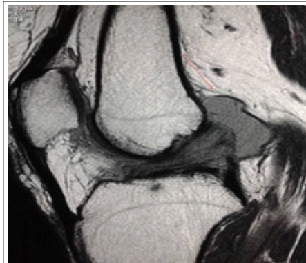
Figure 2: Sagittal proton density-weighted magnetic resonance image shows ill-defined anterior cruciate ligament with increased signal intensity and a "celery stalk" appearance of intact fibers.