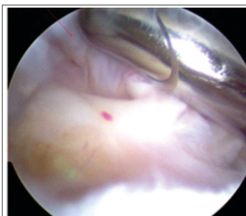
Figure 4: Pre-debridement arthroscopic view showing yellowish content in the anterior cruciate ligament.