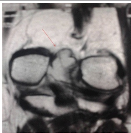
Figure 1: Coronal proton density-weighted magnetic resonance imaging shows a thickening of the anterior cruciate ligament.