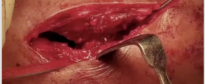
Figure 3: The Mersilene tape and Ethibondare passed through the medial hole in clavicle to exit superiorly

alignment with no loss of reduction (Fig.8).