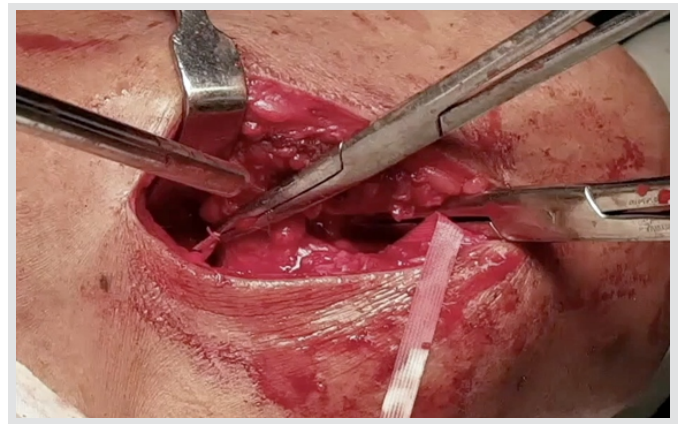
Figure 7: A Mixter is used to pass the Mersilene tape under the coracoid.

required for the removal of the plate or wires [15]. Some authors have recommended plate fixation along with the coracoclavicle suture construct [4, 16]. This construct has been proved to be biomechanically superior to a stand-alone plate fixation of the fracture [17]. Indirect methods of fixation have been recently described with good outcomes. Closed-loop Endobutton fixation, suture anchor fixation, dog bone fixation, and Tight rope fixation are some of the indirect methods, which have been used recently [6, 9, 18]. Coracoid-clavicle fixation has been proved to be biomechanically superior to plate fixation [19]. In addition, the coracoid-clavicle button fixation has been proved to be as biomechanically strong as the plate and button together [19]. However, drilling through the coracoid has resulted in coracoid fracture and neurovascular injury [20, 21]. Closed-loop Endobutton technique has been reported to have good outcomes, but it requires additional exposure and dissection of the undersurface of the coracoid with an open technique or a risk of eccentric placement of the coracoid hole through the arthroscopic techniques, while also increasing the cost of the treatment at the same time [22]. Cortical Endobutton construct has also been reported to fail overtime or subside in the clavicle cortex in few cases [23, 24].