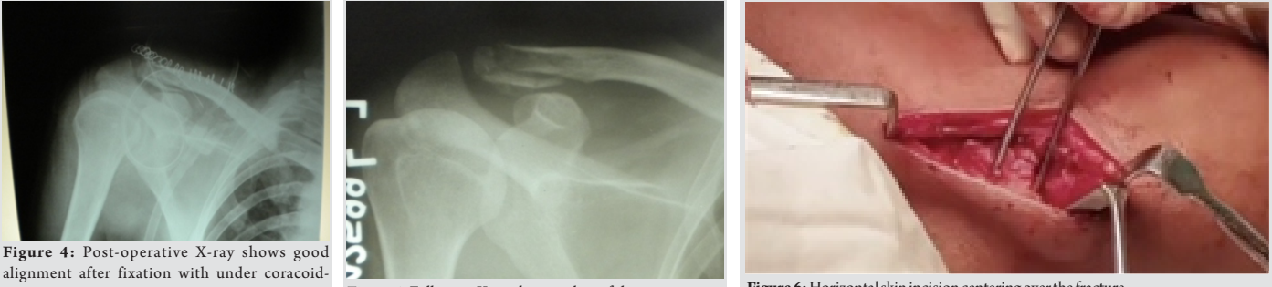
Figure 6: Horizontal skin incision centering over the fracture.