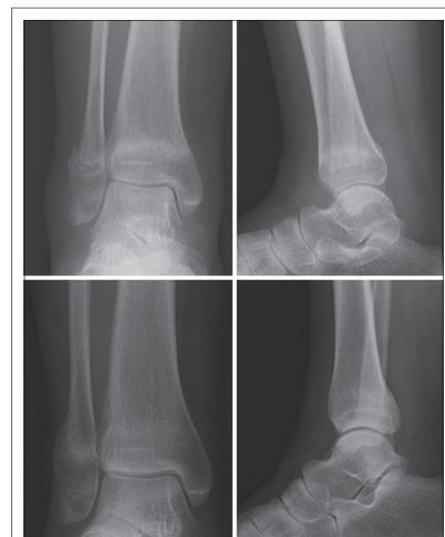
Figure 2: Ankle radiographs a month following lower leg pain onset (upper panels). Sclerotic zone was apparent in distal tibia and fibula without significant deformity. Radiographs 5 months following leg pain onset (lower panels). Fractured distal tibia and fibula were healed and remodeled.

In our case, the patient had bilateral severe osteoarthritis of the hip, and her affected side became the main supporting limb after arthroplasty. In our case, fracture may have been caused because of decreased bone